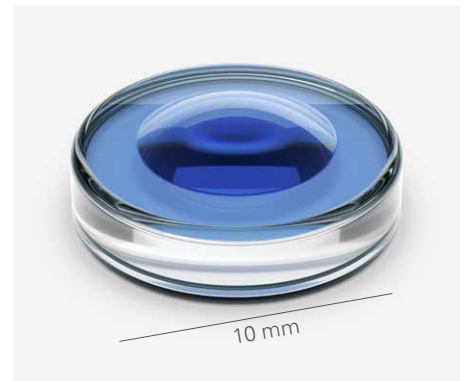
PML asphere with customized coating