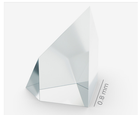
Complex roof prism